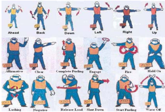
Fig. 2 Static and dynamic FDO gestures

parametric kNN neighbourhood scheme ( k = 1, 2, 3 \dots 10 ) to evaluate the disparity in data sets. Precision/Recall metrics in EROS accommodates proportion of k to the volume (recall) which consists of k number of samples of class of interest. High values of precision (% 100) indicates higher disparity in data set. Further information about EROS can be found in [22].