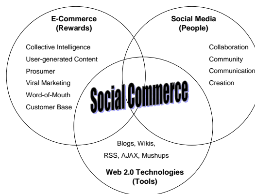
Fig. 2: A Triad Relational Model of Socioeconomic Life on the Web

Fig. 2 below illustrates a triad relational model of socioeconomic life (social commerce) on the Internet today. As a conceptual representation of the three spheres of human perspective with regard to this study, e-commerce, especially person-to-person interaction, is viewed as vital to the online social networks and Web 2.0 technologies.