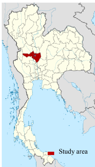
Fig. 1 Study area located in Nakhon Sawan province