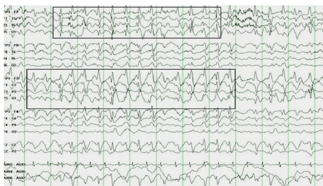
Fig. 5 EEG shows right central spike-and-slow wave IEDs and focal slowing in a patient with a right frontal tumor with partial seizures

Temporal intermittent rhythmic delta activity (TIRDA) is a unique form of intermittent rhythmic delta activity. It consists of an intermittent monomorphic burst of delta frequencies maximal typically in a unilateral temporal derivation. The presence of TIRDA has a strong association with partial seizures. It may provide localizing capabilities in patients with temporal lobe epilepsy. TIRDA is often associated with interictal epileptiform discharges (IEDs) and is abnormal. Fig. 6 shows TIRDA activities of 46 year patient with ganglions.