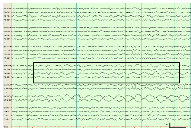
Fig. 6 EEG shows TIRDA activity observed in a 46-year-old patient with glioblastomas tumor. Highlighted area shows abnormal delta rhythms

Temporal intermittent rhythmic delta activity (TIRDA) is a unique form of intermittent rhythmic delta activity. It consists of an intermittent monomorphic burst of delta frequencies maximal typically in a unilateral temporal derivation. The presence of TIRDA has a strong association with partial seizures. It may provide localizing capabilities in patients with temporal lobe epilepsy. TIRDA is often associated with interictal epileptiform discharges (IEDs) and is abnormal. Fig. 6 shows TIRDA activities of 46 year patient with ganglions.