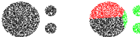
Fig. 3 Splitting of a large cluster by Partitional Algorithm [4]

The algorithm is typically run multiple times with different starting states. The best configuration obtained from all the runs is used as the output clustering [2]. Fig. 3 [4] provides a simple example of partitional clustering.