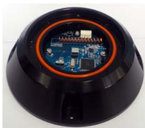
Fig. 2 The sensor node in enclosure (lid not shown)

Each parking space has a sensor node equipped with an AMR sensor deployed in the center. Fig. 2 and Table I show a picture of the sensor node with casing and the hardware specifications of the sensor node, respectively. Motor vehicles create disturbances on the magnetic field of the earth, which affects the output of the AMR sensor. The sensor outputs show significant differences when the parking spot is occupied and not. The presence of a motor vehicle in a parking spot, therefore, can be detected based upon changes in the output of the AMR sensor mounted on the sensor node deployed in the parking spot.