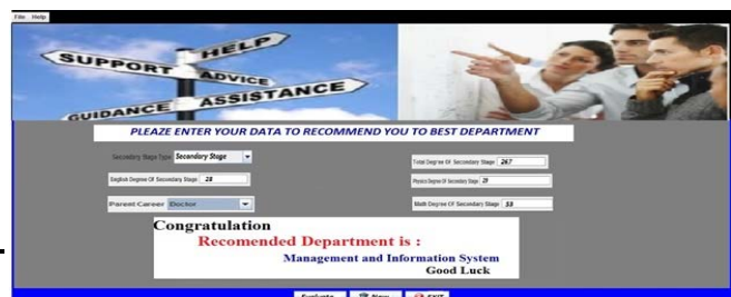
Fig. 4 Framework GUI

Classification and clustering rules are acquired using Tanagra Data Mining software. A system was built using Java SE7 to implement the proposed framework, a graphical user interface was developed as shown in Fig. 4 to enable user to enter the student's data then show him/her are commendation for a department