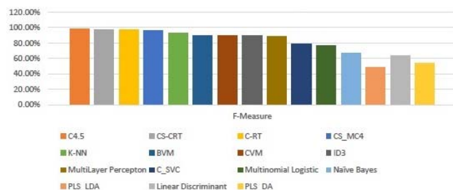
Fig. 1 F-measure for different classifiers

Due to the existence of a lot of classification algorithms, we tested a number of algorithms on educational datasets. The C4.5 proved to be efficient and robust. Fig. 1 shows the average F-measure percentage for different classification algorithms.