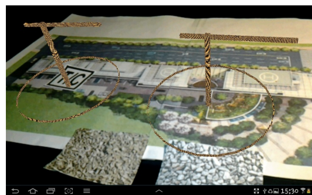
(b) Two tower cranes on different image targets