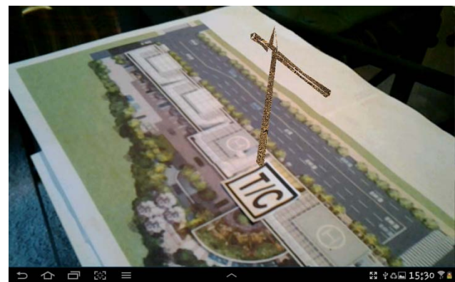
(a) A tower crane on its image target

The use of tower cranes in high-rise building construction takes an objective to decrease construction duration and cost. But the method proposed in this paper to select tower cranes using augmented reality does not include the optimization of the duration and cost. It focuses on reviewing potential for expansion to building construction planning. Future studies may develop a system for temporary works planning including all of construction duration, cost, materials, and equipments.