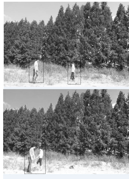
Fig. 3 Simulation result images

To verify proposed algorithm, 100 frames were simulated, and 95 of them were correct detection and 5 of them had false detection by performing 95% of correct detection rate. The some simulated results are shown in Fig. 3. Therefore, proposed algorithm can be used as an effective moving object detection algorithm since it has a high detection rate.