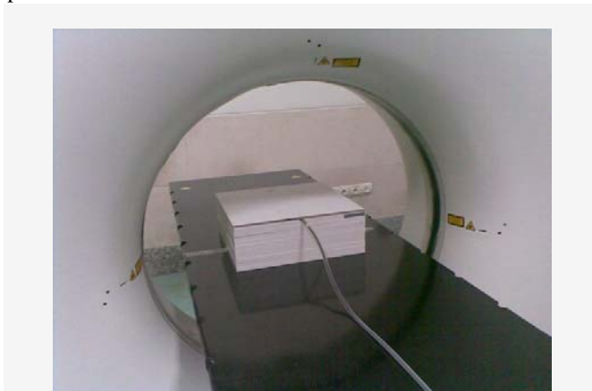
Fig. 1 phantom placed in CT scan device

The transmission factor is the ratio of the doses (at the depth and distance from the source corresponding to the reference condition) with and without the cerrobend in position.