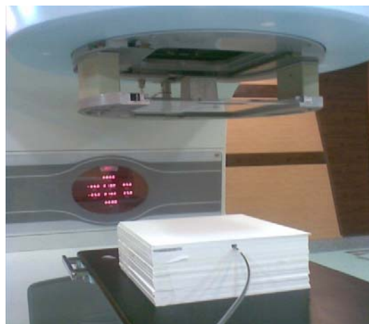
Fig. 2 placement of Tissue equivalent phantom on a flat linear accelerator