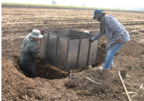
Fig. 2 Conducted trenching experiment for monitoring soil respiration in sugarcane crop

Three trenched plots of 0.8m (depth) x 1.0m (length) x 1.0 m (width) in size were randomly constructed between the row-spacing of sugarcane. Three control plots, areas with roots, were established based on a location relative to the trenched