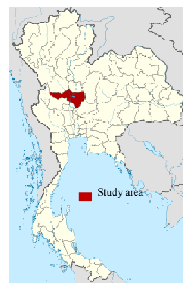
Fig. 1 Study area located in Nakhon Sawan province (Modified from Wikipedia [8])

The experimental site covering an area of 535m 2 is located in a permanent sugarcane field at Nakhon Sawan province situated in the lower northern region of Thailand (Fig. 1).