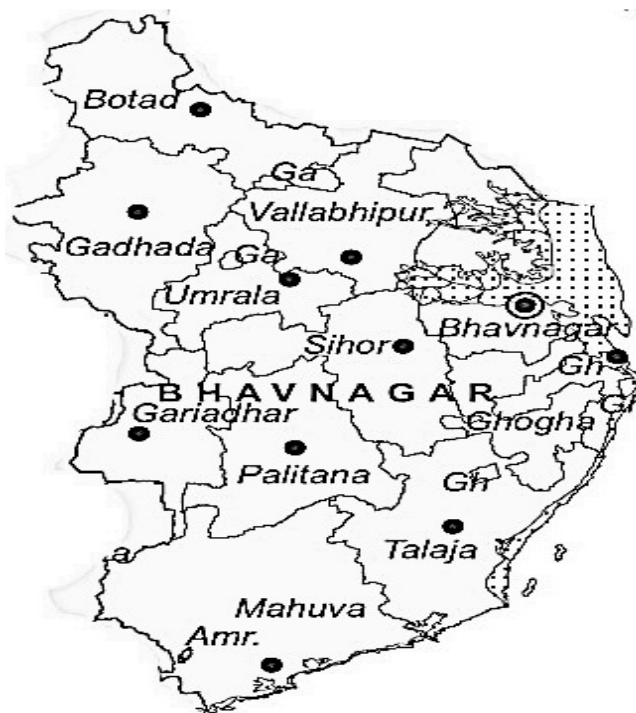
Fig. 1 Location of the study area

Bhavnagar is a peninsular district of South-Eastern Gujarat. It covers an area of over 8334 km 2 . There are close to 800 villages in this district. Geographical location of Bhavnagar district is 21° 28' N (Latitude) and 74° 52' E (Longitude). The main resources of irrigation in these areas are wells and rivers.