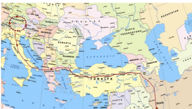
Fig. 2 ITE Pipeline Europe-Turkey-Iran route

The length of the ITE pipeline in Turkish territory is approximately 1790 km up to Türkgözü/Ipsala-Greek border. Pile diameter of ITE is planned to be 56 inches on land and 36 inches of two pipes for sea crossing at Canakkale Strait. Length of the pipeline crossing the sea shall be approximately 17km. ITE Project Planning Time;