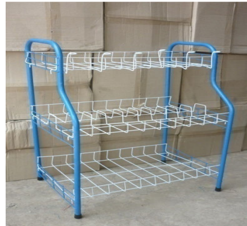
Fig. 2 Kitchen utensils rack

When using the basic mathematical model in the improved methodology, we first have to assure that the product to be developed matches the conditions that are required; i.e. meeting all the assumptions. Particularly, in complying with the necessity that the engineering characteristics should be uncorrelated, product with relatively simple design is considered appropriate. The correlations among engineering characteristics are hard to be avoided in complicated design. In this paper, the simple kitchen utensils rack was chosen to be developed (see Fig. 2).