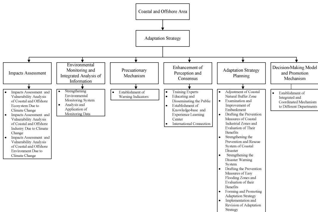
Fig. 1 The outline of coastal zone action plan due to climate change

With the awareness of climate change, the international communities passed the United Nations Frameworks Convention on Climate Change and Protocol, many countries also establish the relevant acts or regulations of climate change to adapt to the impacts of climate change. Although Taiwan started to establish the climate change adapting national policies