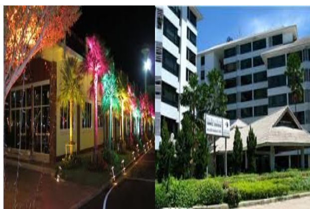
Fig. 7 Lodging in Nakhon Pathom