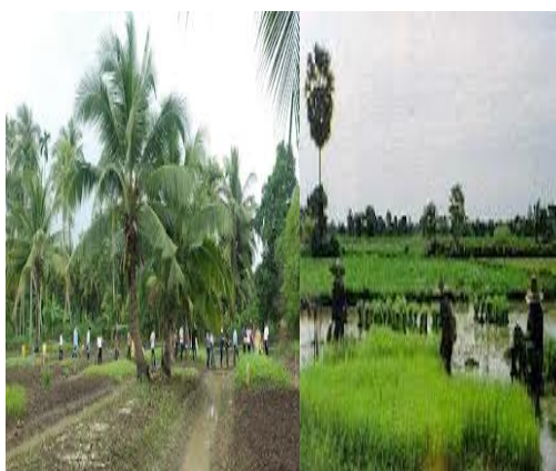
Fig. 4 Agriculture area