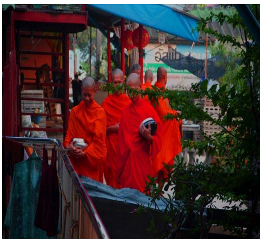
Fig. 3 Morning culture