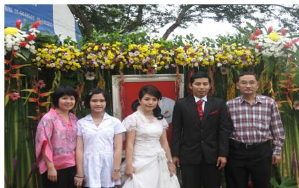
Fig. 9 Wedding ceremony

We have suggestions in two main aspects which are a policy and a suggestion for the entrepreneurs of the resort in Nakhon Pathom. A suggestion regarding the policy for the whole province is that there must be a support for an ecotourism which emphasizes arts, culture, and the beauty of the way of life. Also, the nature must be preserved by raising more awareness of tourists towards its importance to all life on earth. The local people should be encouraged to form a network which lets them share opinions and help one another. Eventually, this will lead to a learning process and an experience accumulation. In order to develop the tourism in this particular area, the policy should not be done hurriedly or by comparing with others. The main goal is to let everybody become involve and thoroughly have them experience the most out of the development. Hence, it can be said that living in accordance with the philosophy of sustainable economy is one approach leading to a real strong community as people are always reminded of a cautious life.