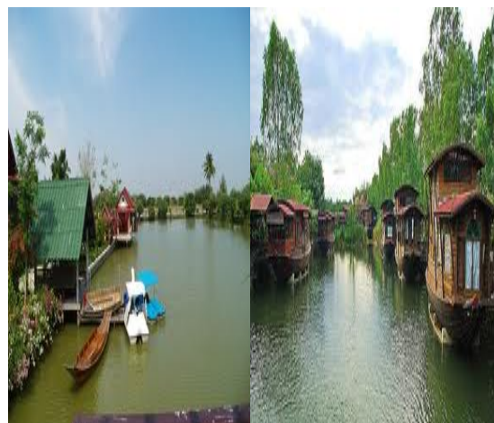
Fig. 6 Lodging in Nakhon Pathom