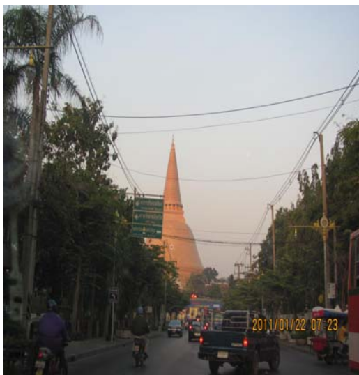
Fig. 2 Environment in Nakhon pathom