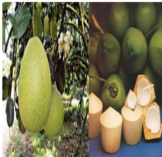
Fig. 5 Pomelo and coconut