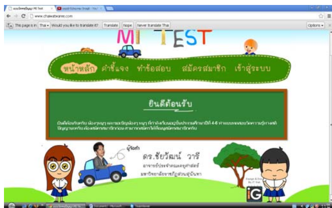
Fig. 2 The Multiple Intelligences Measurement Online