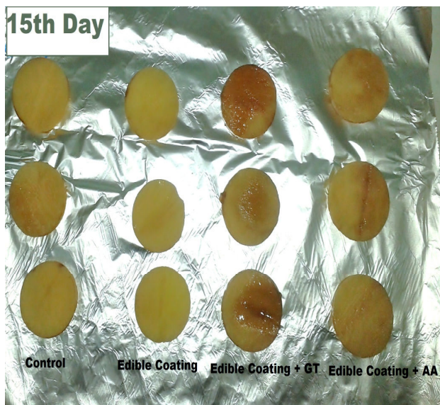
Fig. 3 Samples of potato slices after fifteen days of storage in 4°C: a) control b) edible coating c) edible coating + GT d) edible coating + AA