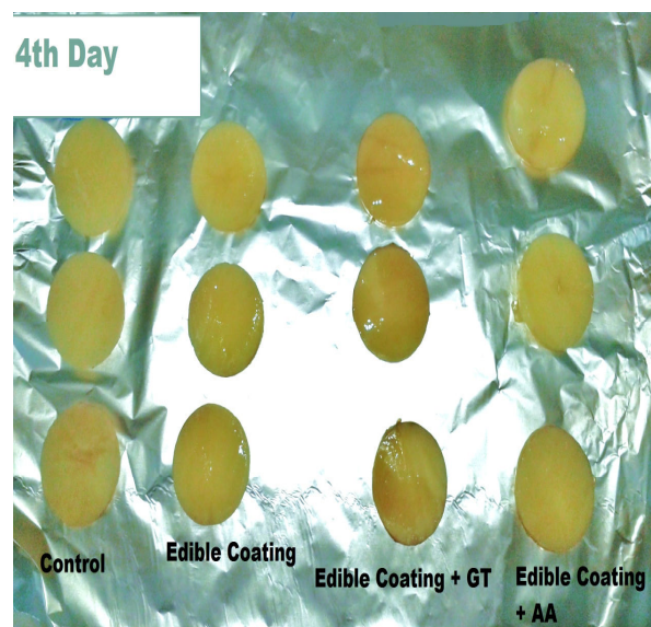
Fig. 2 Samples of potato slices after four days of storage in 4°C: a) control b) edible coating c) edible coating + GT d) edible coating + AA