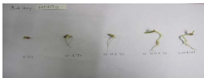
Fig. 1 Germination of Vigna radiata seeds treated with HNO 3 concentrations