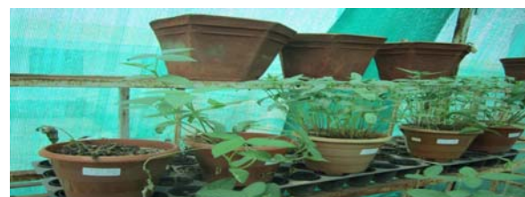
Fig. 5 Vigna radiata showed more growth in 0.1% HNO 3 treated plants