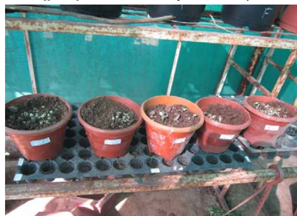
Fig. 4 H 2 SO 4 treated Vigna radiata plants on 3 rd day