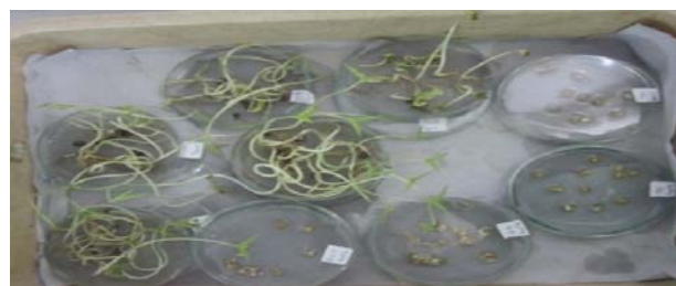
Fig. 3 Germination of Vigna radiata seeds treated with HNO 3 & H 2 SO 4 concentrations on 7 th day. On 10 th day fungal growth was observed in 1% and 0.1% H 2 SO 4 concentrations when all plants were dead