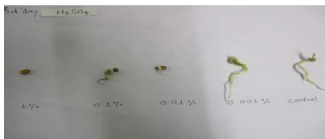
Fig. 2 Germination of Vigna radiata seeds treated with H 2 SO 4 concentrations