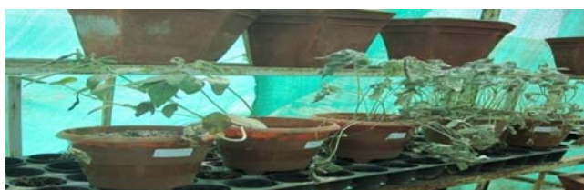
Fig. 9 Dead plants of Vigna radiata