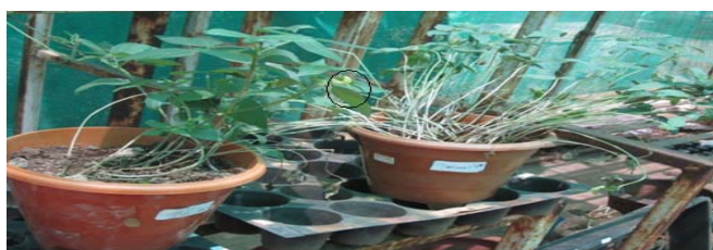
Fig. 7 Flowers were observed on 0.1% \text{HNO}_3 treated Vigna radiate plants

Vigna radiata showed flower in 0.1% \text{HNO}_3 , 0.01% \text{HNO}_3 and 0.01% \text{H}_2\text{SO}_4 treated plants and no flowers were observed on control plants on 34 th day.