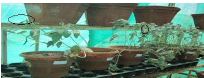
Fig. 8 Vigna radiata 0.1% \text{HNO}_3 , 0.01% \text{HNO}_3 treated plants showed seed

On 42 th day, In Vigna radiata 0.1% \text{HNO}_3 , 0.01% \text{HNO}_3 and 0.01% \text{H}_2\text{SO}_4 treated plants showed seeds on plants.