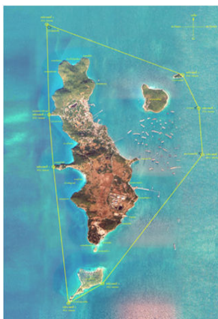
Fig. 1 Sichang Island and Harbor boundary