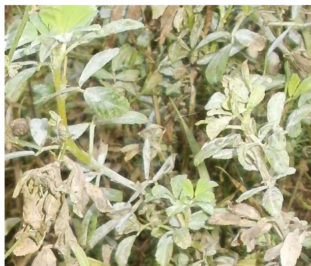
Fig. 5 Plants of fenugreek affected by powdery mildew on experimental field of "LARSAB" (France)