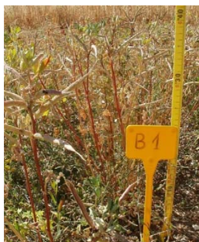
Fig. 3 (b) Plants of fenugreek before harvest sowed at the beginning of April on experimental field of “LARSAB” (France)