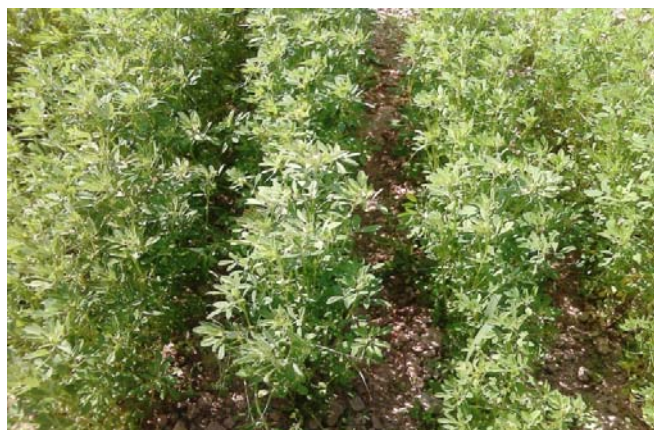
Fig. 2 Plants of fenugreek on experimental field of “Tushkovo” (Belarus)