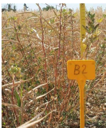
Fig. 3 (a) Plants of fenugreek before harvest sowed at the middle of March on experimental field of “LARSAB” (France)