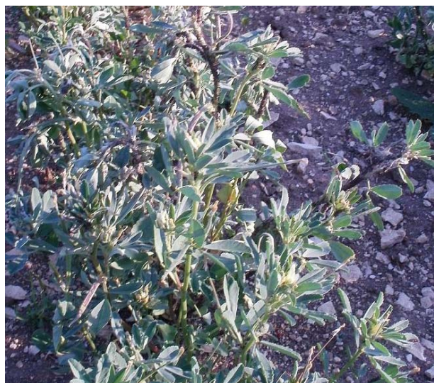
Fig. 4 Plants of fenugreek affected by aphid sowed at the middle of March on experimental field of "LARSAB" (France)