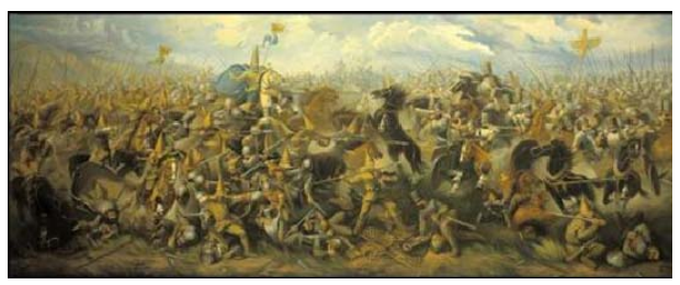
Fig. 11 Karymsak, N., "The Golden Warrior, Saka Battle", oil on canvas, 2001