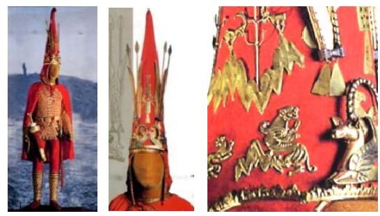
Fig. 4 Golden Man, the head of the archaeological team Akishev Kemal, 1969

An ancient artifact of international significance, found in one of the Issyk burial mounds (50 kilometers from Almaty, Kazakhstan), is the crowning achievement of Saka art of the zoomorphic style. Compared to the looted Pazyryk burial mounds of Gorny Altai (Pazyryk, Bashadar, Tuekty) the "Issyk" Burial Mound (kurgan) turned out to be the only untouched "royal burial site". The excavations of 1969-1970 at the "Issyk" burial mound in Semirech'e showed what garments the leaders of the Saka wore in the V – IV centuries B.C. and permitted the discovery of the features of the cult of the holy prince among the nomads. The Golden Man was dressed in a formal or ritual costume: headdress, tunic, trousers, coat, socks, boots, weapon, and all were decorated with pure gold. There were a total of 4,800 decorations, and out of those, one hundred sixty-five golden articles were done in the "zoomorphic style", found in the first millennium B.C. in the steppes of Eurasia. It is characterized by depictions of animal figures in particular canonical poses and done with distinctive artistic techniques. Also among other items, a silver chalice was found with 26 written characters. To this day, the inscription on the chalice has not been deciphered precisely. Two rings on the fingers of the right hand of the Golden Man are particularly outstanding: one has a mirrorlike shield, the other - a depiction of a human profile in a radiating crown (fig. 5).