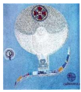
Fig. 9 Sydykhanov, A., "Bird", oil on canvas, 1989

The center of the painting's composition is a large person, who looks like a certain bird. The image of the bird often figures in the paintings of Sydykhanov. The bird appears in his work in all of its mytho-poetic richness, as a symbol of the sky, freedom, prophesy, a symbol of the heavenly spirit, crowning the world tree.