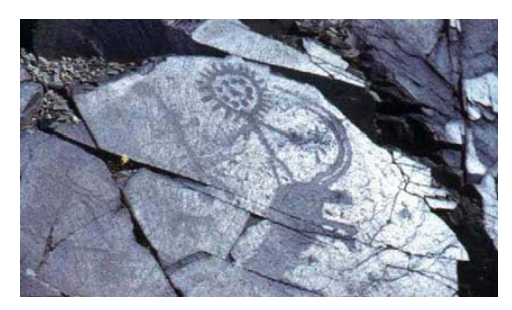
Fig. 6 Petroglyph on a cliff with a depiction of a man with a head of the sun, Tamgaly Holy Place

One of the greatest holy places of the cult of the god Mithra in Central Asia is the site of the petroglyphs of Tamgaly, in the district of Semirech'e, 200 kilometers from the Issyk Burial Mound. Created by nature and by many generations of people, by virtue of its size alone (it is 12 -15 square kilometers) it vividly testifies to the fact that this cult played a very important role in the life of the tribes populating the territory of Kazakhstan. Worshipping the Sun, the ancients could not fail to observe it and other heavenly bodies and to seek their ties to Earth and man [17]. The petroglyphs of the shrine of Tamgaly serve as an example of this, with their depiction of the sun god in the guise of a man with the head of the sun, standing alone or standing on the back of a bull (fig. 6).