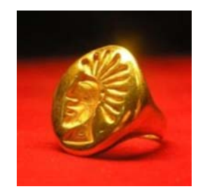
Fig. 5 Ring with the image of a human profile with a radiating crown, Issyk Burial Mound

An ancient artifact of international significance, found in one of the Issyk burial mounds (50 kilometers from Almaty, Kazakhstan), is the crowning achievement of Saka art of the zoomorphic style. Compared to the looted Pazyryk burial mounds of Gorny Altai (Pazyryk, Bashadar, Tuekty) the "Issyk" Burial Mound (kurgan) turned out to be the only untouched "royal burial site". The excavations of 1969-1970 at the "Issyk" burial mound in Semirech'e showed what garments the leaders of the Saka wore in the V – IV centuries B.C. and permitted the discovery of the features of the cult of the holy prince among the nomads. The Golden Man was dressed in a formal or ritual costume: headdress, tunic, trousers, coat, socks, boots, weapon, and all were decorated with pure gold. There were a total of 4,800 decorations, and out of those, one hundred sixty-five golden articles were done in the "zoomorphic style", found in the first millennium B.C. in the steppes of Eurasia. It is characterized by depictions of animal figures in particular canonical poses and done with distinctive artistic techniques. Also among other items, a silver chalice was found with 26 written characters. To this day, the inscription on the chalice has not been deciphered precisely. Two rings on the fingers of the right hand of the Golden Man are particularly outstanding: one has a mirrorlike shield, the other - a depiction of a human profile in a radiating crown (fig. 5).