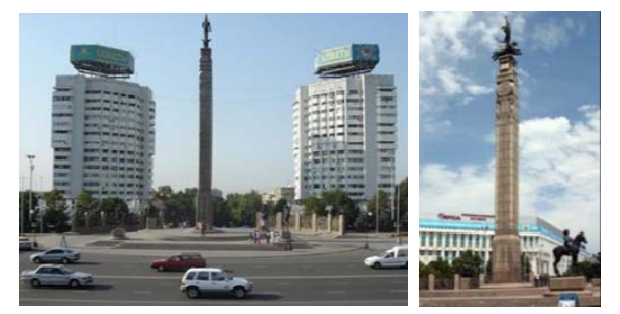
Fig. 1 Monument-obelisk to Independence on Republic Square in the city of Almaty, head of the authors Shota Valikhanov