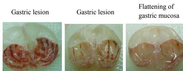
Fig.1 Gross appearance of the gastric mucosa in a rat “(a)” pre-treated with 5 ml/kg of CMC (ulcer control). Severe injuries are seen in the gastric mucosa. “(b)” Pre-treated with 5 ml/kg of omeprazole (20 mg/kg). Injuries to the gastric mucosa are milder compared to the injuries seen in the ulcer control rat. “(c)” pre-treated with 5 ml/kg of Swietenia mahagoni seed extract (400 mg/kg). Very mild injuries to the gastric mucosa are seen, and showed flattening of gastric mucosa.

All values are expressed as mean ± standard error mean. Means with different superscripts are significantly different. The mean difference is significant at the 0.05 level.