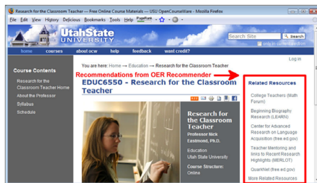
Fig. 2 An example of integrating OER Recommender into a web page

The simplest way to add Folksemantic OER recommendations to a web page is to place a small snippet of HTML in the web page. Additionally, recommendations can be retrieved in RSS, OAI, HTML, JSON, and XML formats. Figure 2 shows an example of a web page that has included the OER Recommender HTML snippet.