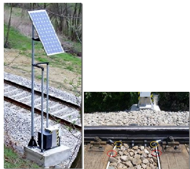
Fig. 2 (a) CL-E1top system (b) Dosing borings

The aggregate (except the sensor) and solar system were installed at the appropriate distance from the rails in order to ensure safer and easier maintenance and composite compound replenishing, while the dosing set and sensor unit were installed directly onto the rail.