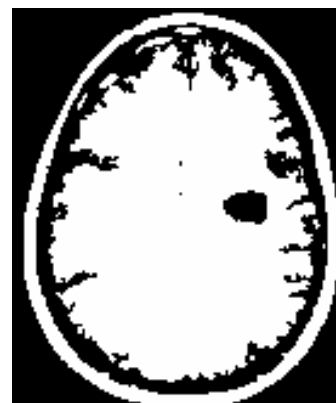
Fig. 1 (b) Magnetic Resonance (MR) image of the brain after applying Fuzzy Kohonen neural network