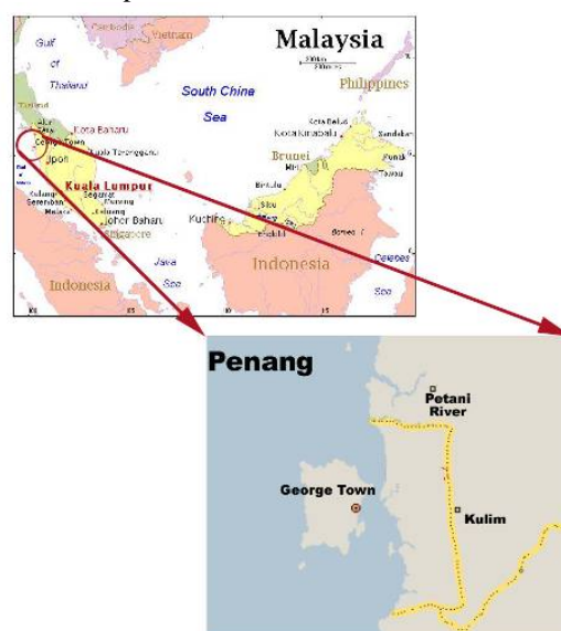
Fig. 1 Study area

The study area is the Penang Island, Malaysia, located within latitudes 5 ^{\circ} 12' N to 5 ^{\circ} 30' N and longitudes 100 ^{\circ} 09' E to 100 ^{\circ} 26' E. The corresponding satellite track for the TM scenes is 128/56. The map of the region is shown in Figure 1. The satellite images were acquired on 5-2-2003, 6-3-02, 15-2-01, 19-3-04 and 17-1-02. The corresponding PM10 measurements were collected simultaneously during the satellite overpasses.