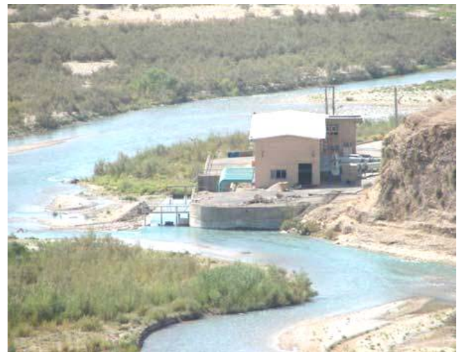
Fig. 2 Boneh Basht pumping station

Considering the location of the suction pools of Kheir Abbad River and the condition of river sediments, sunken sheets with blades must be selected to correct the trend of sediment transfer. Epis not only create a suitable sedimentation pattern but also do not have abnormal effects on the natural behavior of the river and, therefore, do not have unsatisfactory effects on the river environment. By creating secondary spin, change the amount and direction of cut tension of the river bed and result in the collapse of the river bed and creation of platforms. The whirling current is created on the two sides of the sheet due to the development of vertical pressure gradient. The function of multiple and multi-layered (as a collection) sheets and with a defined pattern will have a suitable efficiency.