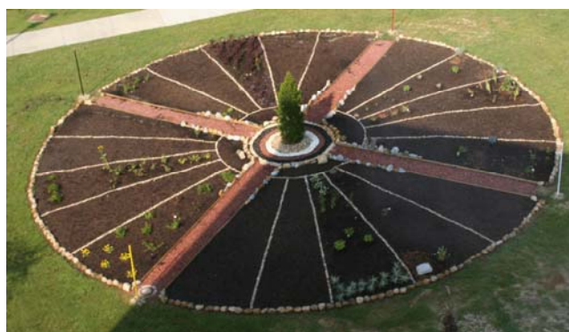
Fig. 1 Photograph of the university wheel garden in its early development

Spearheaded by the Native American student organization at the university, individuals and fifteen student organizations joined the effort to produce and cultivate a campus garden 60 feet in diameter. A photograph taken soon after construction is shown in Fig. 1. At the dedication ceremony, Native American drummers and singers performed traditional songs and prayers. Elders demonstrated how to plant and tend crops in the traditional way, without the use of chemicals and fertilizers. While maintaining its status as a cultural icon and sanctuary for Native Americans, the wheel garden is also an aesthetically pleasing gathering place for students and faculty, an outdoor site for artists and musicians, a teaching laboratory for biologists, and an outdoor learning center for science and mathematics. Thus, the wheel garden provides a place for spending time alone, engaging in spiritual activities, and for teaching and learning.