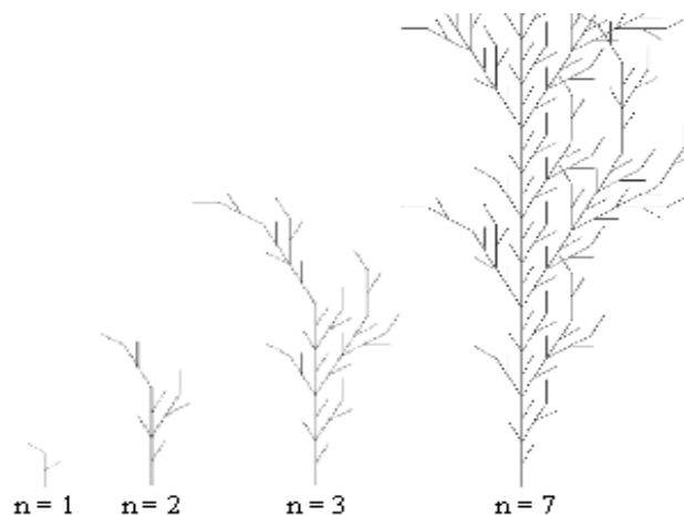
Fig. 2 Like tree structures correspondent to LS1 model

This model generates the like tree structures of Fig. 2.