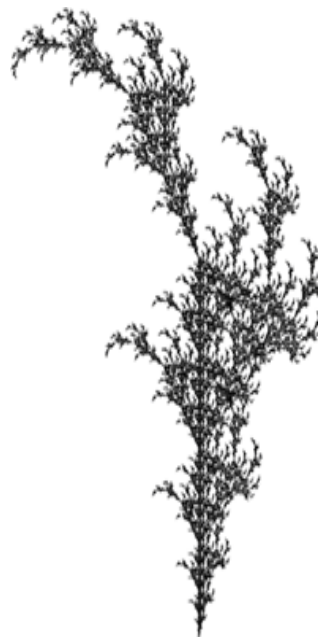
Fig. 3 Like tree fractal shape correspondent to LS2 model for n = 7 and r_1 = r_2 = s_1 = s_2 = 1/2

If we give the values r_1 = r_2 = s_1 = s_2 = 1/2 in (2), we'll obtain exactly the expression given in [7]. With these values we obtain the like tree fractal shape of Fig. 3.