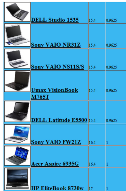
Fig. 3 Calculation of fuzzy values

The application is a storage system which informs the customer about the number of goods at five different stores (off-site storage, Storage: Prague, Brno, Olomouc and Ostrava), and last but not least, there is a possibility of discussion about any laptop between customers and staff. Figure 4 is a sample catalogue of laptops. For more information, see the thesis [1].