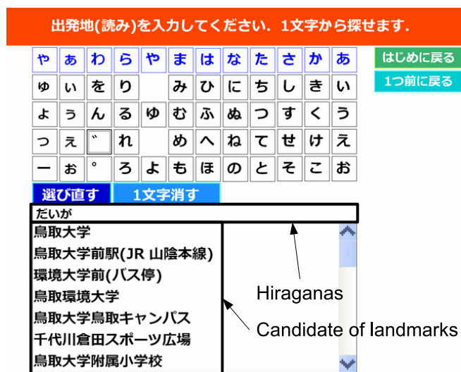
Fig. 7. Input landmark name by "Incremental Search"

The input landmark is sent to the server as sets of CGI parameters shown in section III.