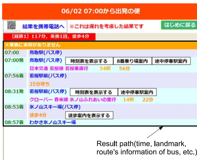
Fig. 9. Path planning result of the "Intelligent-Bus-Stop"

the user searched for in the same condition on the left of the screen. The user read this with the camera of the mobile phone and can confirm the same search result from a mobile phone by accessing it. Since the "Intelligent-Bus-Stop" cooperates with the mobile phone, the user gets on the bus actually, a path can be confirmed. Thus, this leads to improvement of the convenience.