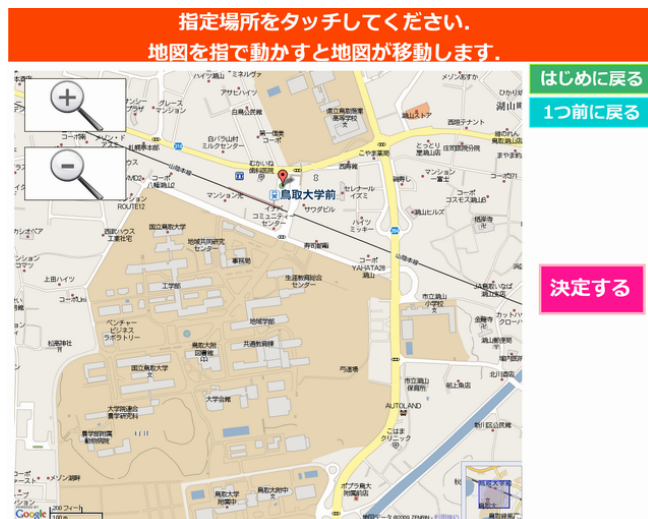
Fig. 8. Input position by "Google Maps"

3) Display of path planning result : When it finishes inputting all conditions necessary for the path planning, "Intelligent-Bus-Stop" send the condition of inputting it to the server of the "Bus-Net" as set of CGI parameters. The path planning is done with the server, and the result is returned as XML. The "Intelligent-Bus-Stop" picks up necessary information from XML. And it displays path planning result easy to see. Fig.9 shows it example. Moreover it displays a QR cord expressing URL of "Bus-Net" which displays the result that