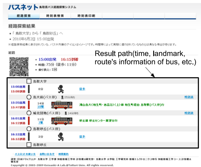
Fig. 5. Result of path planning(PC user interface)

and do. As a result, the input of the condition came to be possible without reloading of a Web page. Since PC version assumes the use from a Web browser as well as a case of mobile phone version, the server of "Bus-Net" generates HTML of PC version and sends to a PC. Fig.5 shows user interface of PC new version.