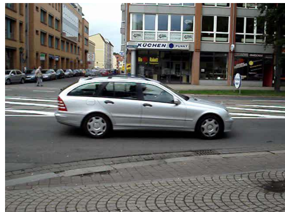
Fig.3 Authenticated frame using the proposed technique. Correlation coefficient=0.9998, PSNR=46.64 dB.

Assume that an attacker removes an object from the authenticated video and places, instead of the removed object, adjacent blocks coming from another authenticated area. Fig. 2 is the original frame and Fig. 3 is the authenticated version. The computed peak signal to noise ratio PSNR and correlation coefficient between the original and authenticated frames are 46.64dB and 0.9998, respectively. In Fig. 4, the car object is removed and precisely replaced by a background coming from another authenticated frame without introducing