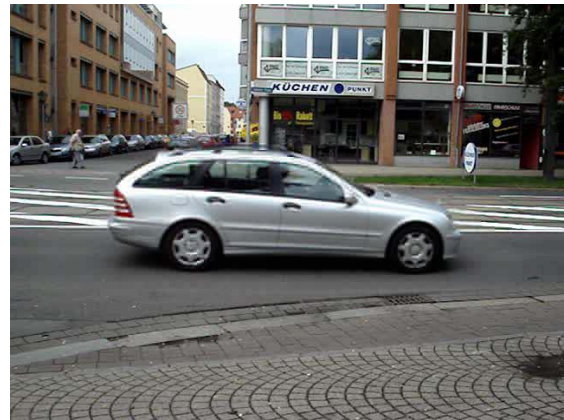
Fig. 6 Verification result reconstructing the altered blocks. Correlation coefficient=0.9939, PSNR=33.15 dB.