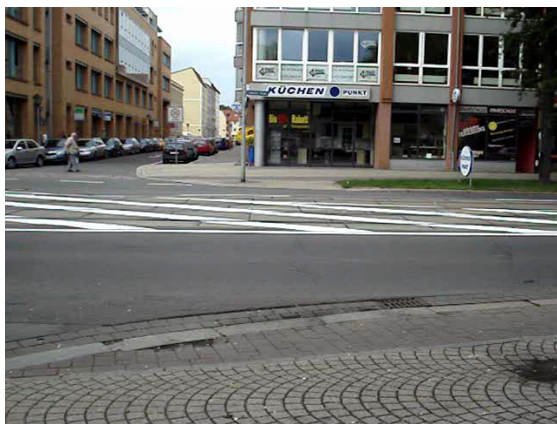
Fig. 4 Altered version of the authenticated frame.

A novel public key self-recovery video authentication technique is proposed. The proposed method is not only capable of localizing the alteration detection but also capable of recovering the missing contents with high reliability using multiple description coding. Furthermore, the proposed technique thwarts VQ attacks using a multiple links chain to securely embed the block signature copies into several arbitrary-distant blocks. Public key algorithms are utilized for guaranteeing the security and permitting anyone to test the authenticity of a given video.