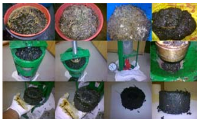
Fig. 1 Production of briquettes using a manually operated screw press

Fuel briquettes were made of a mixture containing 32% spent coffee grounds, 23% coal fines, 11% saw dust, 18% mielie husks, 10% waste paper and 6% paper pulp contaminated water, at moderately low pressure, of about 0.878-2.2 MPa, using hand operated screw press as shown in Fig. 1. All briquettes had an outer diameter of 100mm, inner diameter of 35mm and were 50mm long. There was no need for a chemical binder; the material components underwent natural binding by interlocking themselves by means of partially decomposed plant fibers. This would allow the measurement and estimation the maximum possible briquetting pressure attained by the press. Parameters such as moisture contents and densities of the briquettes were measured.