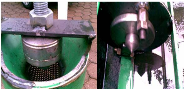
Fig. 2 Screw press equipment used for making fuel briquettes.

The following equations were used to calculate the axial load of the screw press [8].