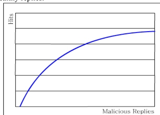
Fig. 1 Diminishing Marginal Utility of Malicious Reply

On the other hand, for healthy replies, marginal utility increases. Malicious replies tend to repel readers, but healthy replies tend to attract more readers to visit the board. Thus, equilibrium forms between the marginal utilities of malicious and healthy replies.