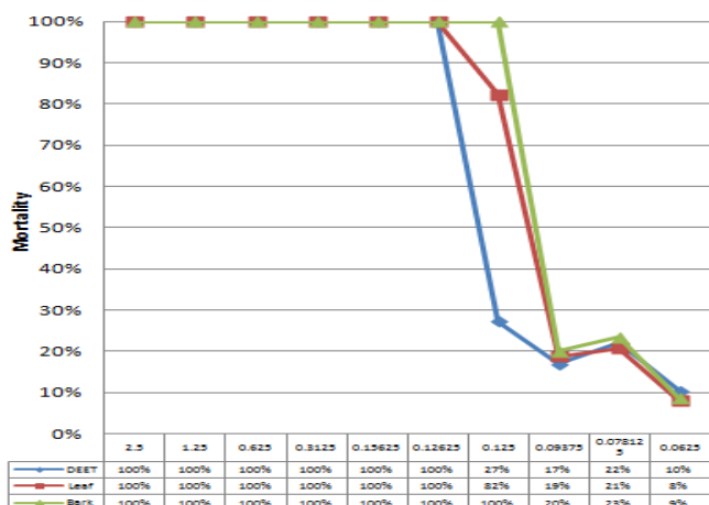
Fig. 1 Results for acaricidal effects