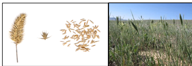
Fig. 1 Typical spike, spikelet and seeds of A. cristatum at Golestan National Park

Plant Material: The seeds of A. cristatum were collected from Golestan National Park (Iran), located at the east of Caspian sea, between 55° 43' to 56° 17' east and 37° 16' to 37° 31' north, with a mean annual precipitation of 300 mm and the average temperature of 12.7°C. Altitude of collections ranged from 1500 to 2000 m in hilly terrain of park. The habitats of Agropyron spp. were visited periodically (approximately in every 15 days) to record phenological stages. Spikes of vigorous plants were harvested at the seed ripening stage (i.e., during summer of 2008) to obtain viable seeds (Fig.1).