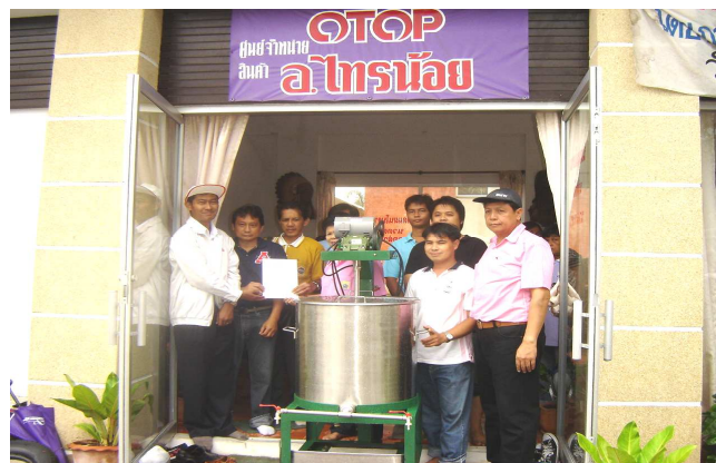
Fig. 4 Delivery of the prototype

The overall result from the prevalent management of OTOP producers is high but not very high. In terms of leadership, the score is 4.05 out of 5, Likert scale. The second is organizing which score is 4.00. The quality control is 3.95. The lowest score is 3.69 which is raw material planning. For the overall scale of readiness of producer score is 3.75 or high, but not very high. In detail, communication has the highest score which is 4.24. Second is product improvement which has a score of 4.20. Third is 3.31 for packaging. For the overall scale of support from the public sector, it is 2.77 which is a medium score. In detail, the highest score goes to the certification service for local OTOP product which is 3.52. Second, the training service from public sector is 3.36. Finally, the lowest score goes to the assistances to find raw material for local producers which score is 2.20.