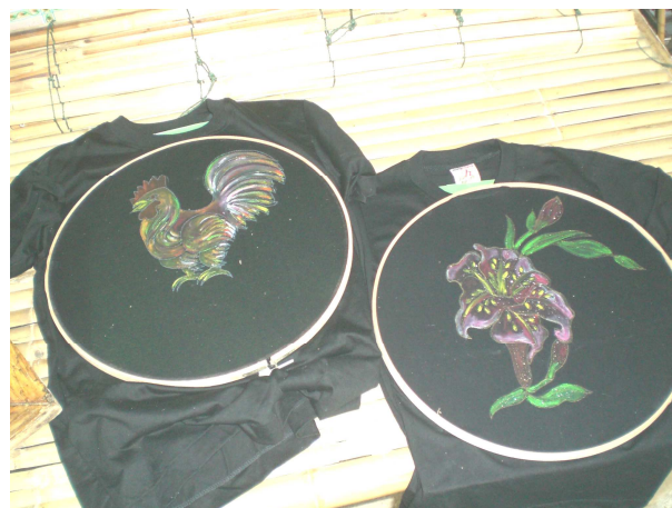
Fig. 7 Art painting patterns

product soon after they got some kind of awards. Kongsompee, 2007 [7] stated that government needs to find place for OTOP products to display and the promotion of OTOP products for exporting should be focused on high potential and high quality OTOP products only.