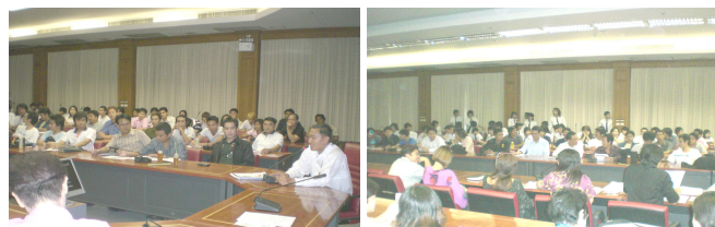
Fig. 1 Focus group

Sithisom ,2010 [9] illustrated about the essential factors that make a difference in each producer: product development, marketing plan, and customer satisfaction have found that there are creative ways to empower local producers. 1) Share knowledge and create local identity. 2) Create network and add more values to products. 3) Focus more on quality. 4) Create team management. 5) Produce with an environment concern. 6) Local ownership. 7) Create community strength with the focus on self-reliance.