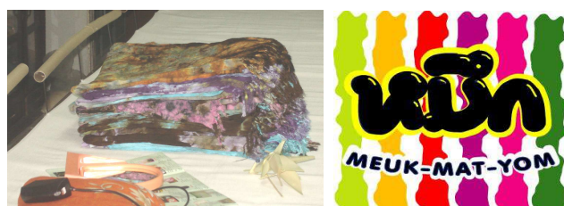
Fig. 5 brand of prototype

However, the local producers have been least certified by Food and Drug Agency of national government. The main reason behind this situation is that food and beverage products are often seriously tested before it get approved by the Food and Drug Agency of national government. Sriwong, 2008 [2] stated that training of local producers lacked of skills in mass production but the strength of community business has no detrimental effects to the environment. Kongsomtub, 2006 [7] pointed out that when the local producers started to duplicate each other ideas and produce similar products, it created the crunch of raw material. Eventually, it unnecessary raised the cost of raw material and price of OTOP products.