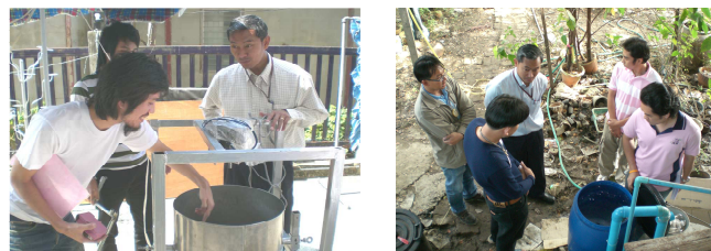
Fig. 3 Prototype development for Continuity

From the study, it disclosed that the majority of local participants are female with the age of 50-60 years old. Most participants have an undergraduate degree or higher with 4-6 years of experience in OTOP productions. Most participants reside in Parkert Amphoe. From the resource and environmental business, it revealed that food and beverage received certified from Local government agency about 94.70 percent. Local productions have no damage effects to local environment about 86.70 percent. Packaging has been either self or group develop about 85.80 percent. Using local knowledge, local stories, and local wisdom is about 70.80 percent.