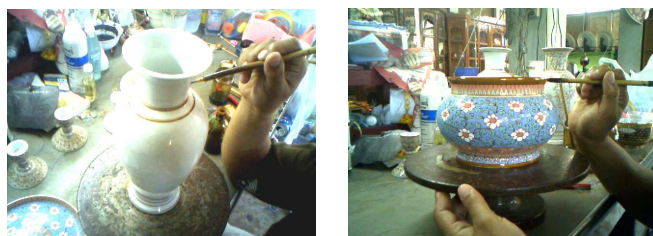
Fig. 6 handicraft prototype