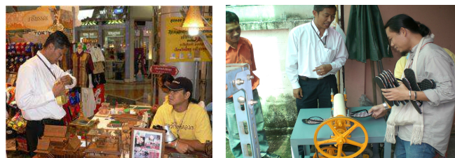
Fig. 2 Continuity of Development tools

This research focused the study on the local OTOP producers in Nonthaburi province. The population is 156 local OTOP producers registered with local government from 6 districts and 52 Towns (Towns and local government units). Sampling was utilized by using Krejcie and Morgan table (1970). Simple random sampling was done by drawing a total of 113 local producer names out of 156 local OTOP producer name population.