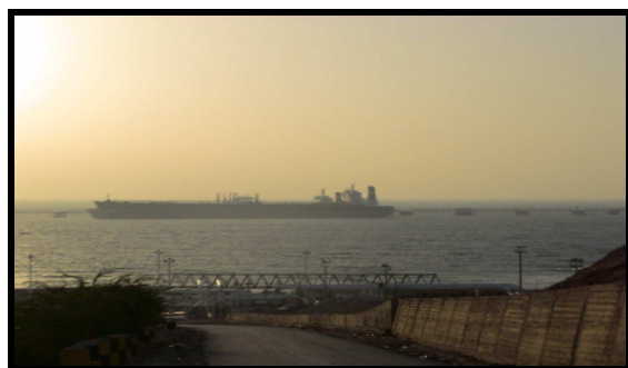
Fig. 10 Azar Dock