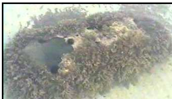
Fig. 7 Khark plants life