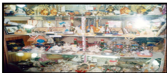
Fig. 12 Handi Craft