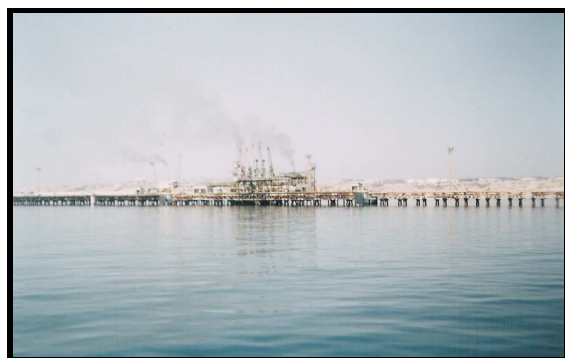
Fig. 9 A view of T dock