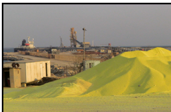
Fig. 8 Sulphurous hill in Khark coasts

Therefore; it is necessary to pay attention and emphasize on ecotourism; by considering environmental potentialities in cultural tourism and ecotourism not only the problems of the local people will be solved but also it prepares the situation to attract tourists from other provinces in Iran and abroad.