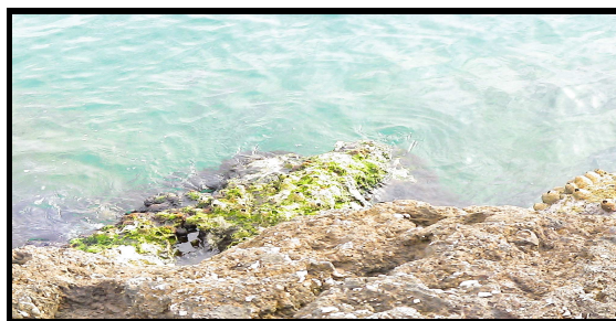
Fig. 3 Algae growing on rocks in Khark Island