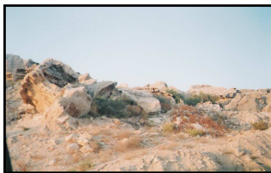
Fig. 2 mKhark Coral Reefs and Geology