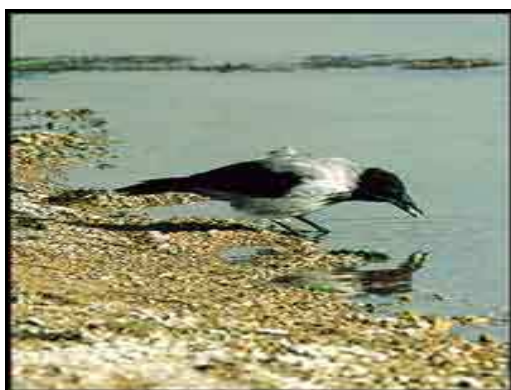
Figs. 5 and 6 Khark Wild life

One of the most active part of ecotourism industry is going to natural beautiful areas and watching closely different plants' and animals' species especially wild animals in their natural homes. These are attractions for a lot of tourists. Variety of plants' species in Khark and Kharko Islands are the same as south of Iran; therefore strong dry climate plants with deep roots grow there. Although; plants' species in these two islands are limited, but from the middle of November some small parts of the islands are covered in green; which is about 1/3 of the islands. This view can be seen mainly in north and west mountainsides and at the same time half of the north mountainside is covered by snow. Herds of gazelles and birds' garden are some examples of the wildlife in the islands; also the marine life on the seashores, floating algae and algae covering the rocks, rocks which are the place of living for different species of fish and mollusk, in these places birds, tortoises and lobsters lay eggs; all of the above mentioned are the ecotourism potentialities of these islands