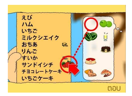
Fig. 3 Interactive element in the lesson