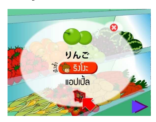
Fig. 4 Learning vocabulary from fruits in the basket