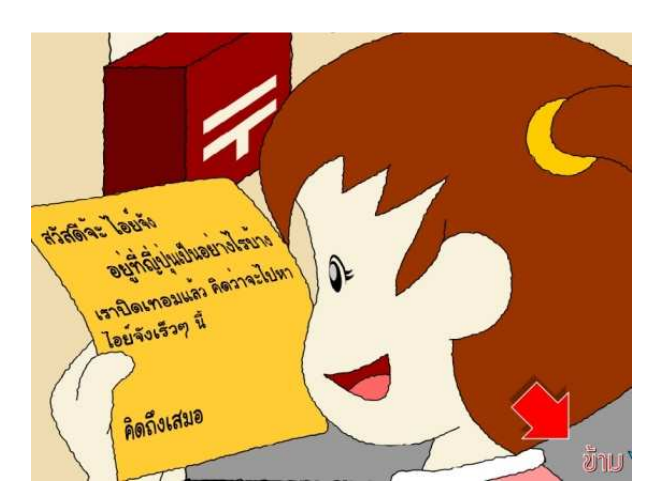
Fig. 1 Introduction page

Besides the interactive online multimedia instruction on basic Japanese vocabulary, there were tools to evaluate the quality in terms of contents and mass media production: the quality assessment form for the interactive online multimedia instruction on basic Japanese vocabulary and the satisfaction evaluation form for the sampling group.