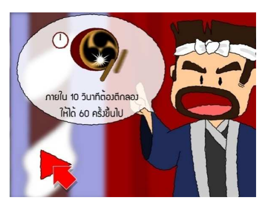
Fig. 5 Vocabulary test

A. Mass Media Quality of the Interactive Online Multimedia Instruction on Basic Japanese Vocabulary