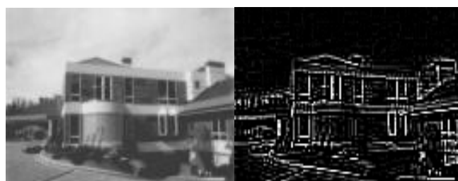
Fig. 3 The application of the two components of the gradient for a sample image