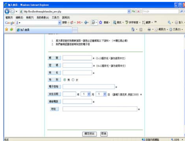
Fig. 2 User interface questionnaires

In the proposed prototype system, a personalized intelligent learning system is constructed and aimed at providing adaptive learning material either in 2D or in 3D form for students. In the system, there are four modules that interact with each other to produce adaptive learning content to suit individual student's need.