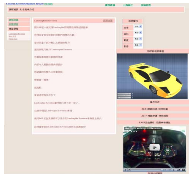
Fig. 4 The presentation of adaptive results

In the first phase of constructing the system, training data containing personal backgrounds and learning preference is restored and clustered in the student module using clustering analysis. In the second phase, this system presents adaptive contents to an online student whose learning preference is unknown. The first phase is established offline and the second