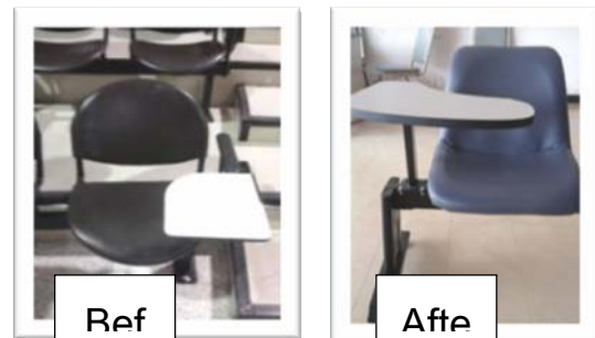
Fig.3 The ergonomics lecture chair before and after improvement

Then student 100 people in the same group before improvement. They trial to used ergonomics lecture chair 30 minute/people .and evaluate again by RULA, Body discomfort survey and take satisfaction questionnaire. The ergonomics lecture chair before and after improvement present in Fig.3 and the picture from student trial before and after improvement present in Fig.4.