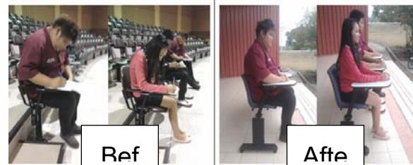
Fig.4 the picture from student trial ergonomics lecture chair before and after improvement present

The result from trial new chair after improvement where body parts have value when fatigue lower average is back below from 2.91 to 0.87 followed by the neck from 2.93 to 1.24 back on from 2.33 to 0.84 the results using evaluation RULA ago - after improvement was found that the fatigue average parts. Body samples after the experiment chair made ergonomics is reduced with statistical significance with a confidence level of 95% (p-value = 0.002), where body parts have value when fatigue average declined from head and neck 4.00 to 2.25 where the body 3.75 to 2.00 of the strength of muscles, arms, 1.00 to 0.25, respectively.