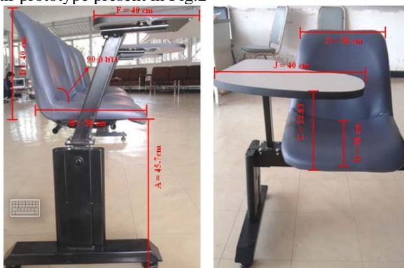
Fig. 2 The ergonomics lecture chair after improvement

After measurement anthropometry dimensions the researcher used data from anthropometry combined with data from ergonomics chair guideline [4]. In table IV refer data of research use for chair design. Then they design ergonomics lecture chair prototype 3 unit for trial. The ergonomics lecture chair prototype present in Fig.2