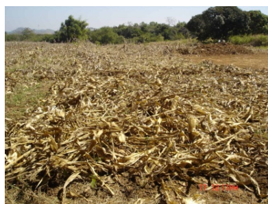
Fig. 4 Biomass prepared for open burning

A prescribed burn experiment was conducted at the corn field. Area of the prescribed burn was 7\text{ m} \times 8\text{ m} . The burning was prepared and conducted by traditional way of farmer (Fig. 4- Fig. 5). Farmer prepared the biomass by bending the residues down and igniting the fire at an upwind point. The measurement was conducted to monitor BC concentration in the ambient air by measuring before burning and monitor emission during burning by measuring in the plume. The black carbon concentration was measured real-time by Micro Aethalometer (model AE51, Magee Scientific, USA) at flow rate 5 ml/min. The emission of BC concentration from open burning of corn residues was measured by installing the Micro Aethalometer at 1 m height ground level downwind and moving to keep inlet of the instruments in the plume all the time.