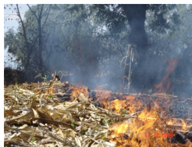
Fig. 5 Open burning of corn residues in the field

After finish burning, ash and unburned residues were collected back and analyzed for moisture content at the laboratory to consider dry mass for calculating combustion efficiency.