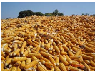
Fig. 3 Biomass moved out of the field