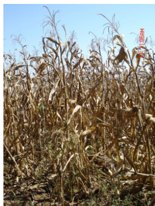
Fig. 2 Biomass remained in the field

g_{dm}/m^2 ). The collected samples were used as a fuel for simulating open burning experiment in the chamber.