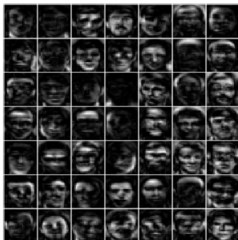
Fig. 4 The basis images of NPCA on ORL database results.

We randomly select n ( n=2, 4, 6 ) images from each person for training, while the rest of images of each individual for testing. The average accuracies of training samples ranging from 2 to 5 are recorded in Table . The recognition accuracies of PCA, NREMF, and NPCA are 34.1%, 66.7%, and 67.2%, respectively, with 2 training images. The performance for each method is improved when the number of training images increases. The recognition accuracies of PCA, NREMF, and NPCA are 92.8%, 93.5%, and 96.3%, respectively, with 6 training images. The recognition ratio of the test set reached 100% in each approach.