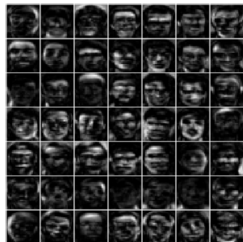
Fig. 3 The basis images of NREMF on ORL database results.