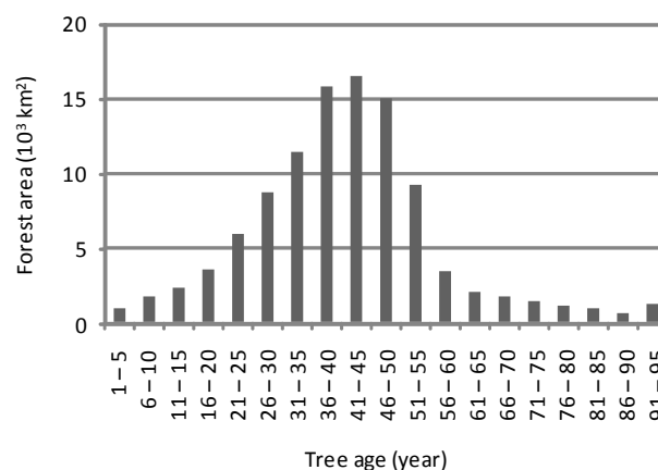
Fig. 3 Tree age in the artificial forests of Japan

Japan has one of the highest rates of forest cover of all nations, with greenery covering 66% (251,000 km 2 ) of the country. Approximately 40% (104,000 km 2 ) of total land area is artificial forest populated by planted cedar, cypress, and larch. Reclamation projects of artificial forests made rapid progress during 1950s to the early 1970s. These projects were intended to provide ligneous resources to restore the devastated country following World War II. Conifers such as cedar and cypress were selectively planted because their rapid growth rate enables quick reclamation and market supply of ligneous resources. Since the 1970s, however, Japan's forestry industry has been following a course of decline due to the decrease in lumber demand and increase in cheap imported materials, and domestic wood products continue to lose international competitiveness. According to the Annual Report on Forest and Forestry in Japan, 262,000 people were engaged in forestry in 1965, but this number had decreased to 47,000 by 2005 [15]. During the same period, the elderly ratio (ratio of elderly employees \geq 65 years old) increased from 4% to 26%. As a result, a tree-planting program to reforest 4,000 km 2 /year was carried out at the industry peak, but this has decreased to 240 km 2 /year. In contrast, the decrease in domestic demand has caused an overstock of fellable ligneous resources (>50-year-old trees). Fig. 3 shows tree age distribution in the artificial forests in Japan.