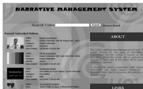
Fig. 3 NMS Main Page

Fig. 3 shows screenshot of the main page play video page.