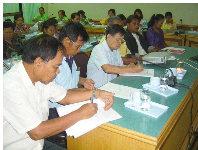
Fig. 1 Community leader training

with many problems and obstacles. In managing training, a distance to training locations and training course design irrelevant to the needs of participants become more problematic. Next in the line are insufficient numbers of facilitators and staff, and inadequate funding for training [10]. From these problems and obstacles associated with training, there occurs a developmental idea in a form of “distance training.” Long-distance communication appears as two-way communication which brings many parties to face-to-face encounters with natural sights and sounds. Thus, it facilitates all parties involved doing various kinds of their group activities [3]. However, essential modern instruments and installations of video conference for distance training high technology deployment consume high costs and high budgetary allocations, the researcher as a technology management expert would like to find appropriate ways and means to enable a suitable model for distance training possible and workable for community leaders in the upper northeastern region. This proposition will be pursued with the hope that it will solve the problems and consequently lead to the sustainable development of local communities in a not-far-distant future.