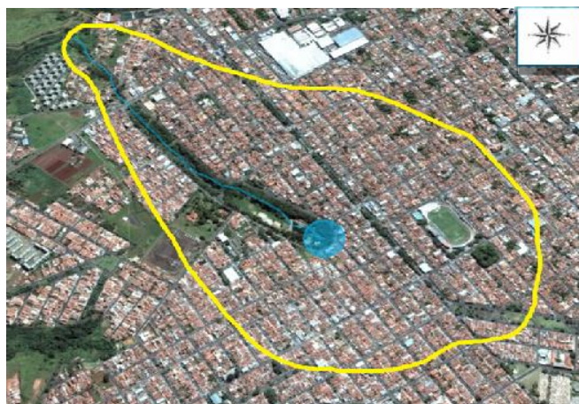
Fig. 4 Sub-basin of the Medeiros stream (No scale defined)

The PPA of the Medeiros stream has a higher homogeneity in terms of tree cover and less human interventions in the river channel, compared to the PPA of the Tijuco Preto stream.