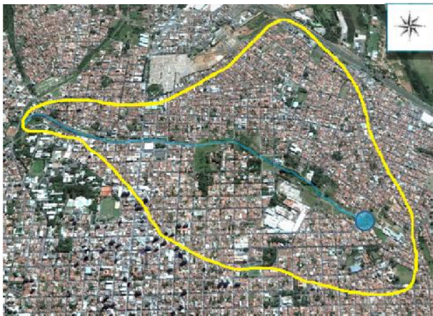
Fig. 2 Sub-basin of the Tijuco Preto stream (No scale defined)

The spring of the Tijuco Preto stream is at an altitude of 846 meters, under the coordinates 203175.16 E/7563233.03 S (UTM SAD 69, Zone 23S). From the source to the mouth, the stream has a length of approximately 2.900 meters and flows into the Ribeirão do Monjolinho, the main water body of the city of São Carlos (Fig. 2).