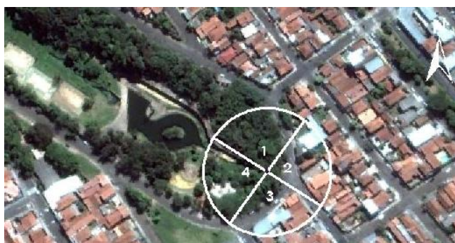
Fig. 5 Quadrants used for the analysis of the PPA in the Medeiros spring (No scale defined)

Fig. 5 indicates the passage selected for analysis, corresponding to the PPA of the source, and the division of quadrants that were used.