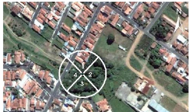
Fig. 3 Quadrants used for the analysis of the PPA of the spring of the Tijuco Preto stream (No scale defined)

Fig. 3 indicates the stretch selected for analysis, corresponding to the PPA of the source, and the division of quadrants that were used.