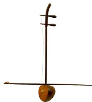
Fig. 12 Dan Gao Truong Ngoc Thang Traditional Musical Instrument of Viet Ethnic Group