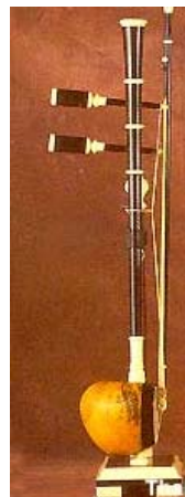
Fig. 11 Saw U http://www.thaitambon.com/tambon/tsmepdesc.[7]