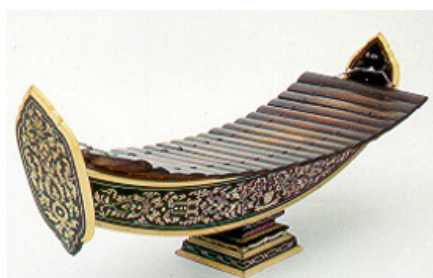
Fig. 3 Ranat Ayk http://www.thaigoodview.com/node/50264 [3]

Third, Thai percussion instruments consist of Ranat Ayk, Ranat Thum, Ching, Chap, Hhawng Wong Yai, Hhawng Wong Lek, Glawng That, Taphon, Thon, Rammana, Glawng Khaek, Sawng Na.