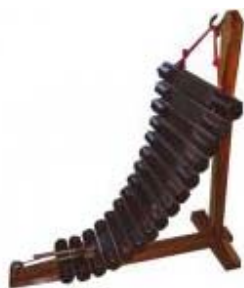
Fig. 9 Pong Lang http://ponglang.com/web/product.php [6]

There are some kinds of musical instruments which are similarity between Thailand and Vietnam, for example, Pong Lang in Thailand and T'rung - Đàn T'rung in Vietnam, Saw U and Dan Gao, Khlui and Sao ngang.