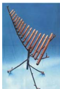
Fig. 10 T'rung - Đàn T'rung Truong Ngoc Thang Traditional Musical Instrument of Viet Ethnic Group