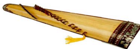
Fig. 5 Tranh zither- 16 strings Troung Ngoc Thang : Traditional Musical Instrument of Viet Ethnic Group [5]

Plucked strings of Vietnamese musical instruments, such as, Tranh zither- 16 strings, Moon-Shaped Lute or Dan Nguyet, Dan Day, Dan Bau, Dan Tam, Dan Ty Ba, etc.