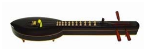
Fig. 1 Jakhay http://www.webpostthai.com/ [1]

There are many kinds of Thai musical instruments, first, plucked strings instruments, such as, Jakhay, Krajappi, Phin, Serng.